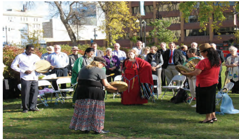
North End Women's Drum Group