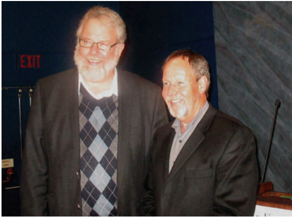
Religion Reason and the Common Good Above: Bill Blaikie and Allan Gregg

On October 23rd the 4th Annual Knowles-Woodsworth lecture was given by Allan Gregg, prominent Canadian pollster and political pundit. The lecture, entitled Reason, Religion, and the Common Good, was attended by just over 100 people in Eckhardt- Grammatte Hall. Gregg spoke to his concern, as someone whose entire life has been devoted to the value of research, about the serious decline and devaluation of evidence-based policy making under the current federal government.