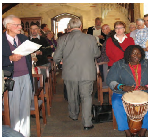
Middle: The Service is over,